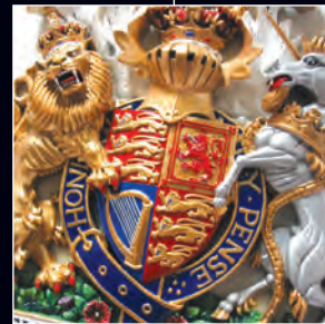
1992 MB Caradon invest £1.3m on new Head Office and National Distribution Centre