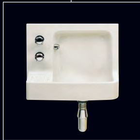
1960 Twyford commence manufacture of vitreous china in India