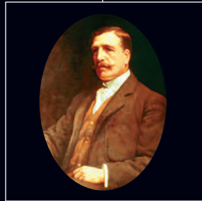
1901 Twyford start production in Germany