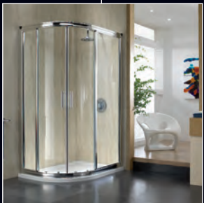
2007 Twyford launch Avalon - the UK's first truly rimless WC