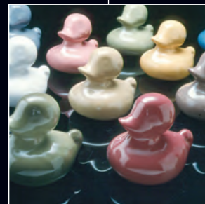
1980s Twyford lead the way in introducing colour to the bathroom