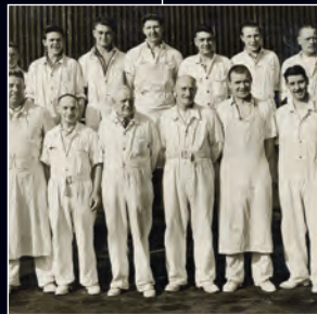
1930 Twyford invent the double trap syphonic innovation