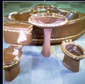
1970 Twyford commence manufacture of vitreous china in Melbourne, Australia